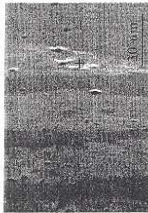
FIGURE 2 The contrast image of antiparallel domains on -c surface of \text{LiTaO}_3 . The regularity of domain structure on -c surface is worse than on +c surface since the electrode stripes for domain reversal is on the +c face.

We also observed the -c surface of the sample (Fig. 2). On -c surface, the background was the negative polarity, therefore, darker, and the inverted domains were the positive polarity, therefore, brighter. The observation result is consistent with that of the +c surface.